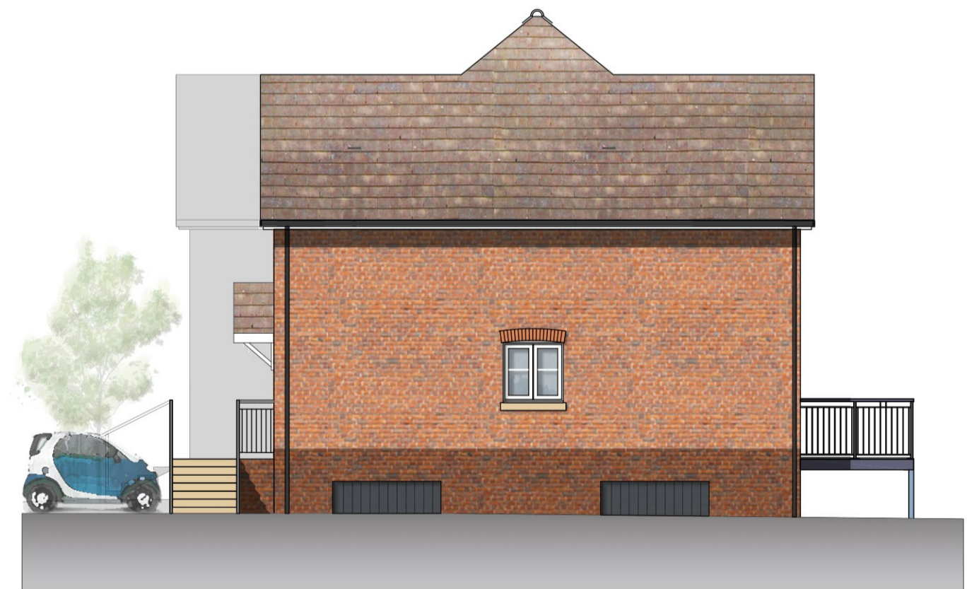
Cottages terrace 06 - Side (West) Elevation