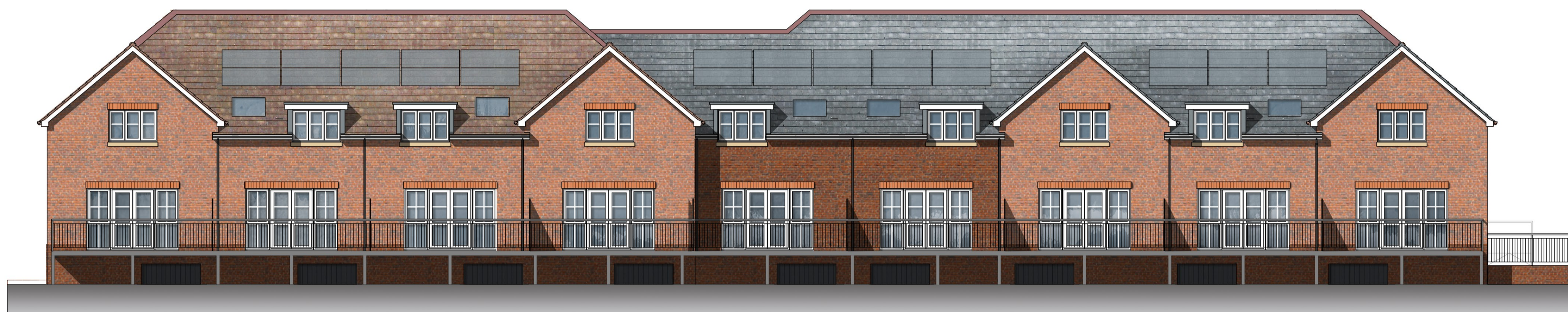
Cottages terrace 06 - Back (South) Elevation