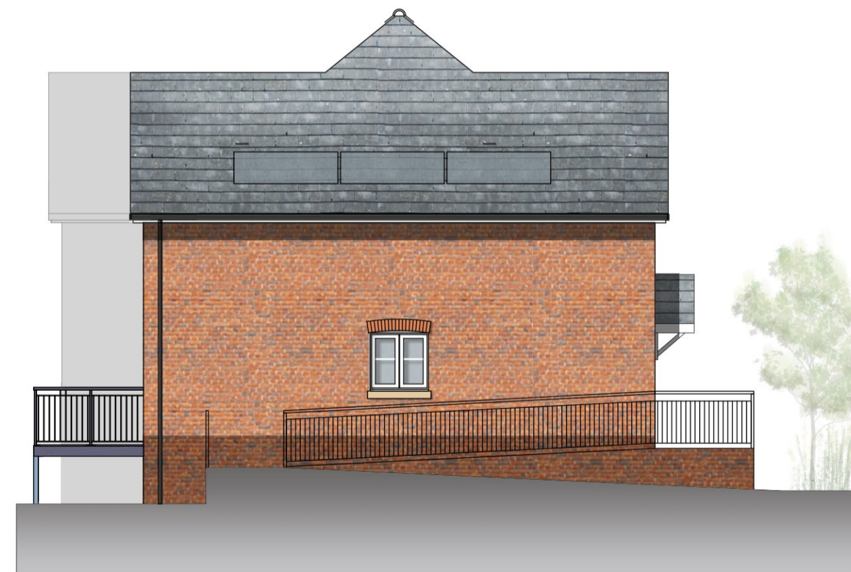
Cottages terrace 06 - Side (East) Elevation